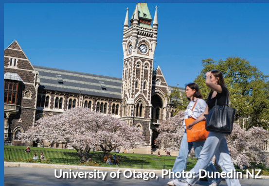
University of Otago

You will immediately feel at home in Dunedin. Dunedin is the home of New Zealand's oldest university, the University of Otago, and students enjoy the benefits of being educated in a vibrant university city. Dunedin is an attractive city with a population of 126,000. It is not too big and not too small, yet has all the amenities and infrastructure of a larger city.