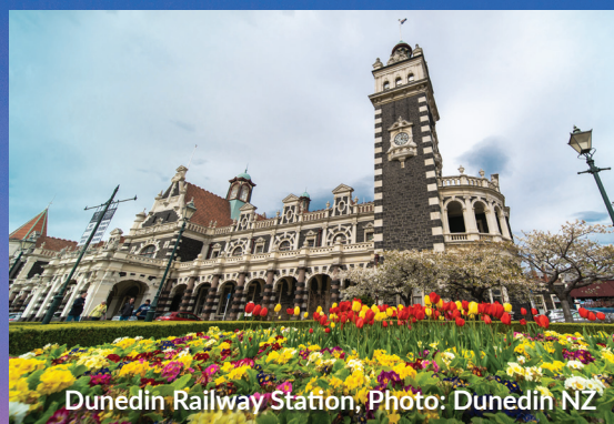
Dunedin Railway Station