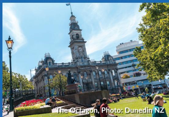
The Octagon, Photo: Dunedin NZ