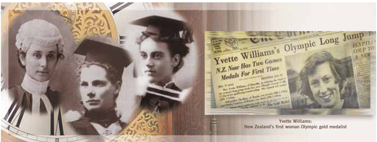
Ethel Benjamin: New Zealand's first woman lawyer

An unequalled tradition of success in educating girls has seen Otago Girls' graduates become New Zealand's first women doctors, lawyers and judges; win Olympic and Commonwealth games medals; and gain international recognition in cuisine, music and the arts.